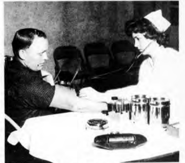
Takes Blood Pressure

Short, clean-cut silage is easy to store and handle. It packs well, there's little spoilage and it stays appetizing, says the New Holland "Grassland News."