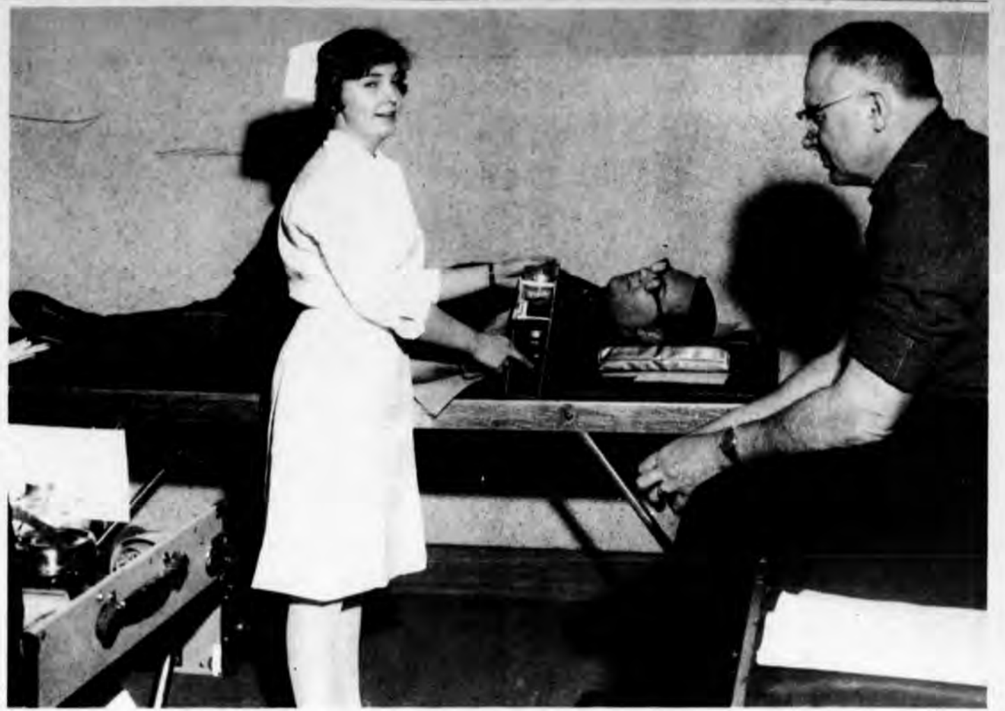
2 Donors Give Blood at St. Johns

The purpose of the Overseas Dependent Schools is to provide statewide public school educational opportunities, grades 1 through 12, to dependents of military and civilian personnel stationed overseas. About 75 per cent of the position vacancies will be in the elementary grades. Teacher assignments are for one school year.