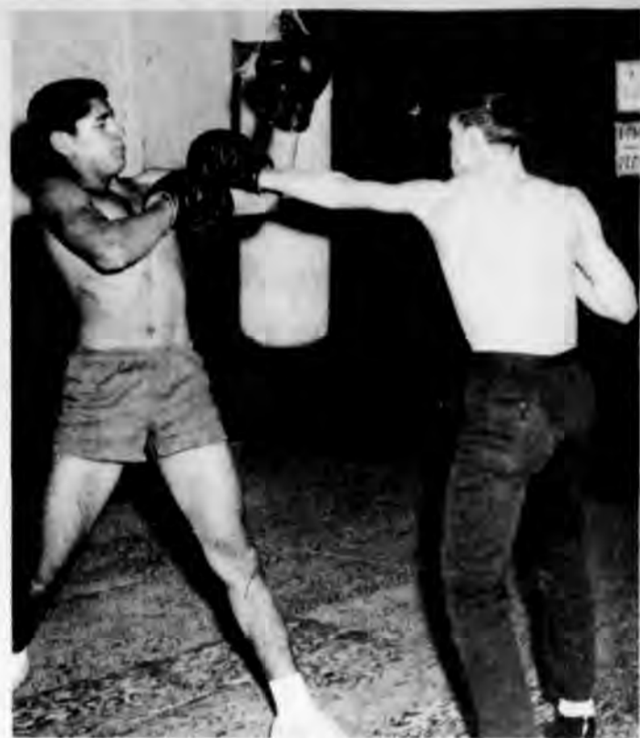
Sharpen Up for Golden Gloves