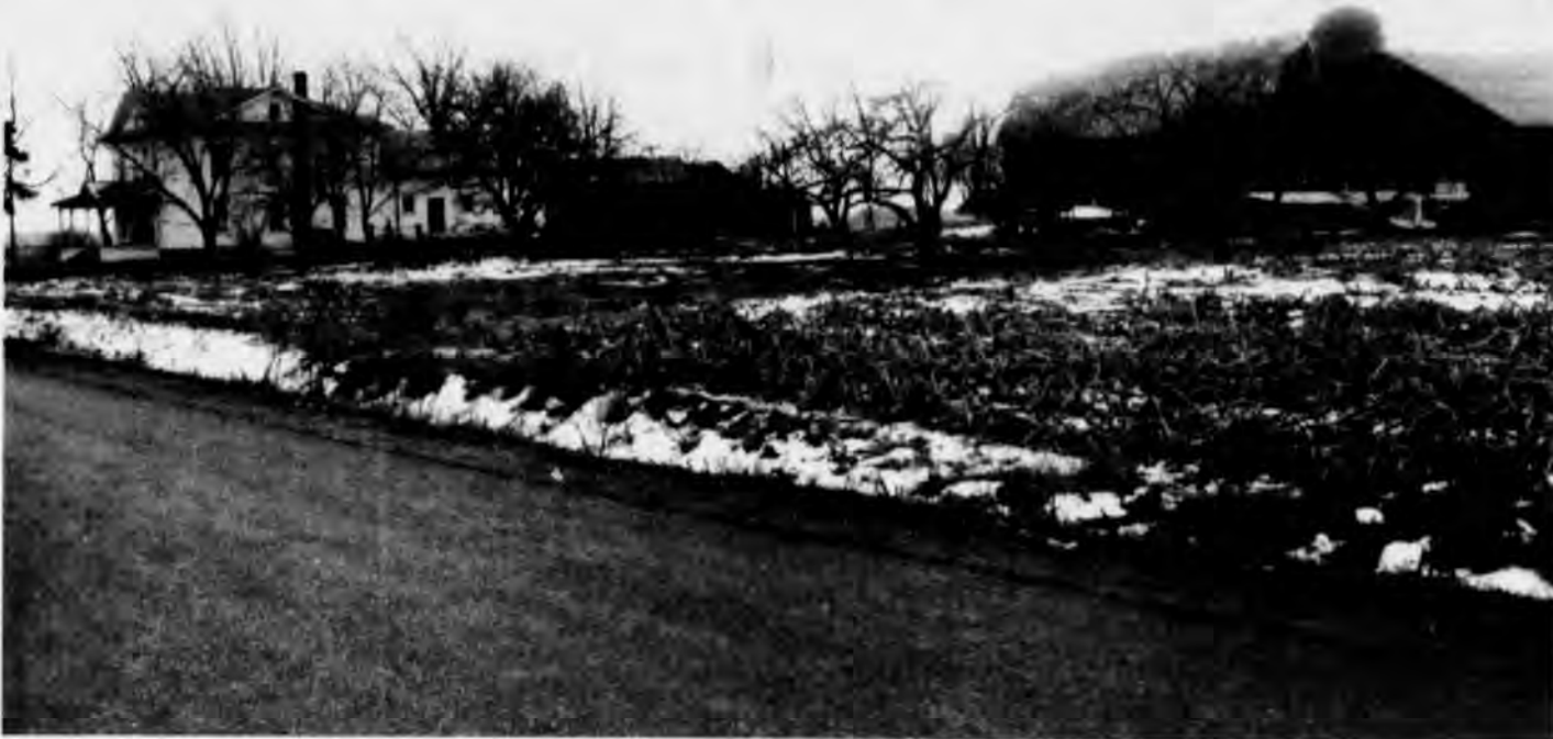
Designate Centennial Farm in DeWitt Township

Winter injury and drying of young trees can be prevented by wrapping their trunks to a height of three or four feet above the ground. Michigan State University extension horticulturists recommend using a commercial tree wrap, starting at the tree's base and working up.