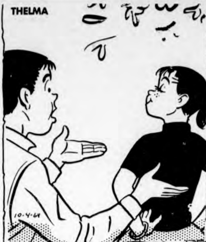
I am not serious - all I said was I didn't like red fingernails on you -!

DAY DREAMS Don't expect to become famous by basking in the shade of a fine old family tree.