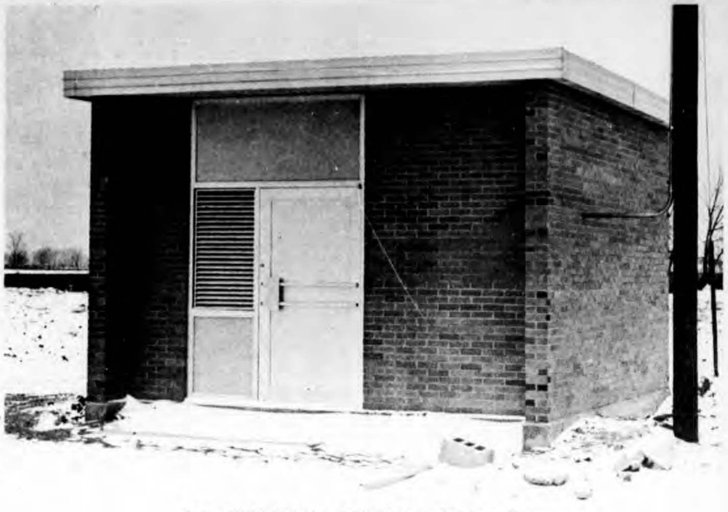
New Well Houses Ready for Standby Duty