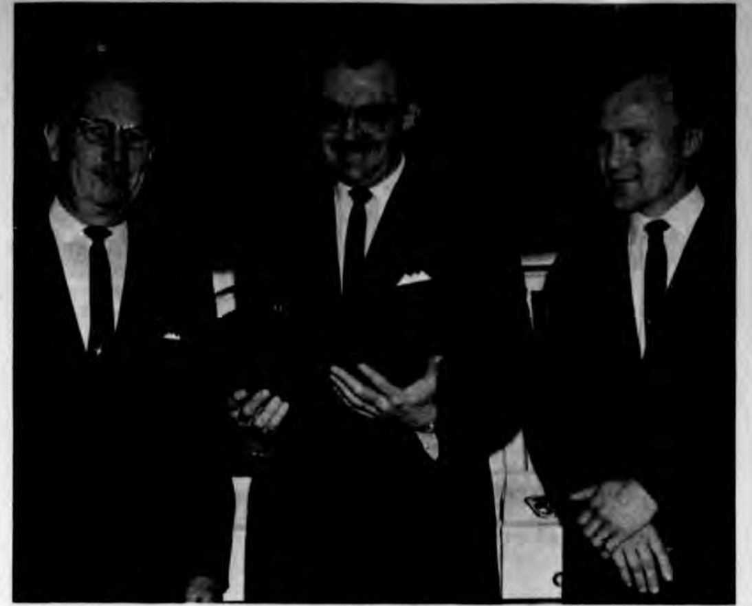
New Owners at St. Johns Ford Dealership