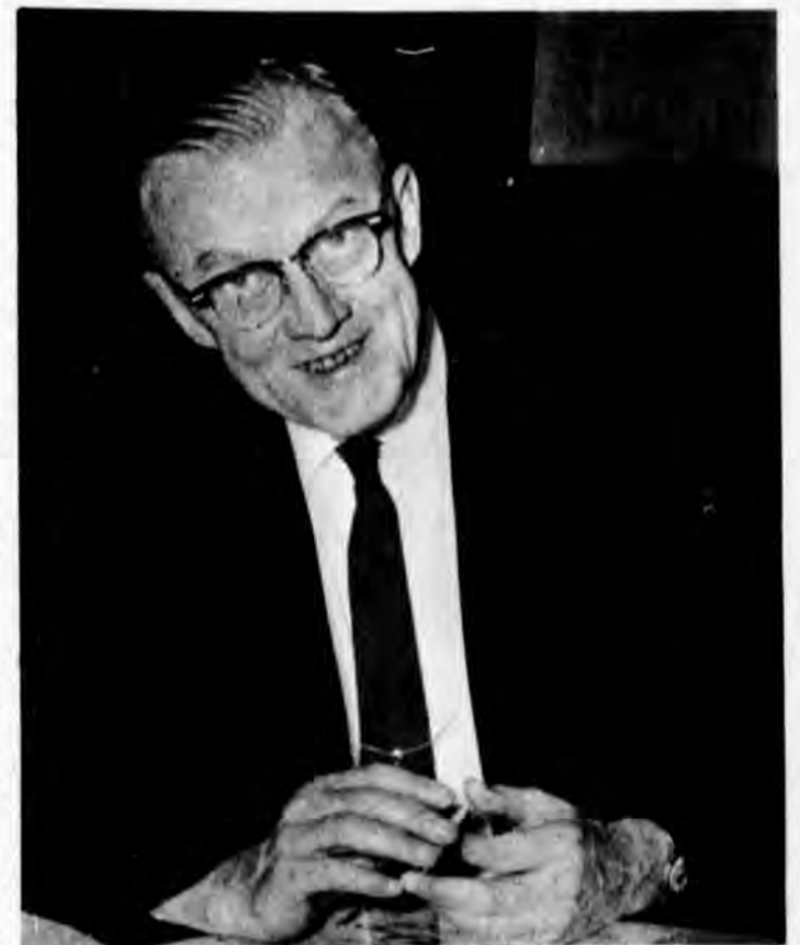
Ends 40 Years in Auto Business