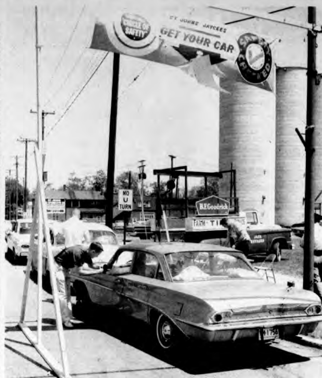
Cars averaged one every two minutes Saturday going through this Auto Safety-Check lane operated on North Clinton avenue by the St. Johns Jaycees. A total of 193 vehicles were checked.